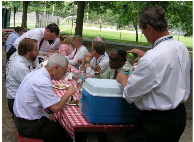
Scenes from last year's chapter barbecue