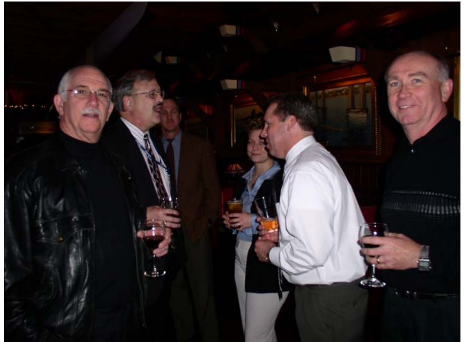
Attendees enjoy the December combined business meeting and happy hour